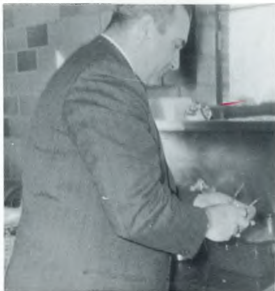
Chief cook and bottle washer