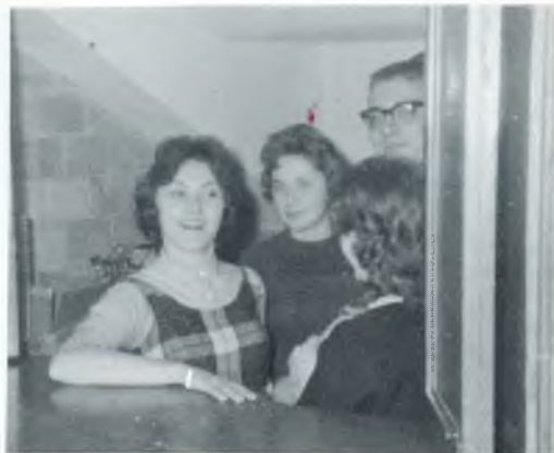
Senior Concessions at Tourney