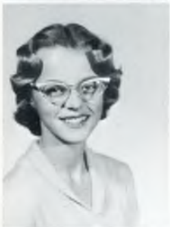
Bonnie Parker—Twinkling star.