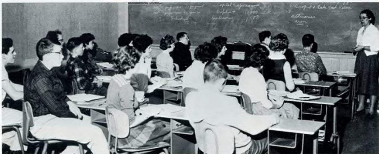
Now who can tell me what "capital" means?