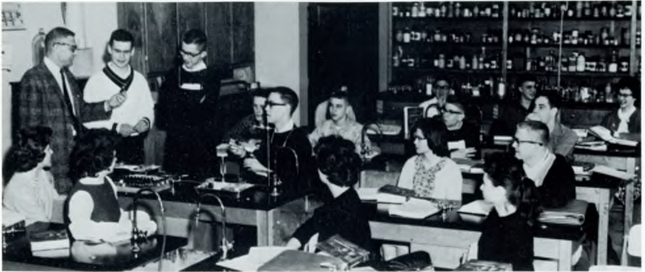
"And if you put this chemical with this . . . chemical?"