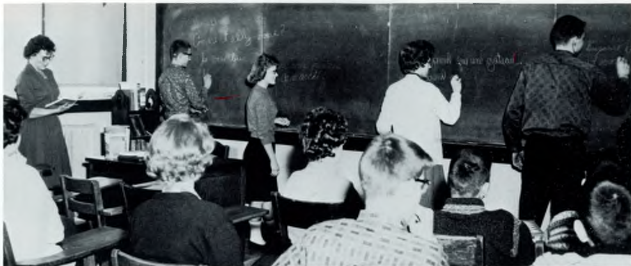
It's all French to me.